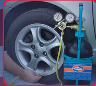
Inflate tire with the Sludge Sucker® Air Chuck