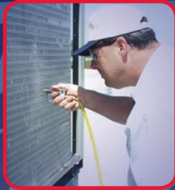
Blow off coils with Sludge Sucker® Blowgun

A versatile, all-in-one kit that includes a Nitrogen regulator with a delivery pressure up to 400 PSI for pressure testing an A/C&R system for leaks. It also includes many accessories for cleaning condensate drain lines and for blowing off coils. It even has a air chuck to fill up that flat tire. As a bonus, our Sludge Blaster® is included (see page 80 for more information). Carry stands are sold separately (see page 41).