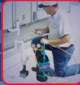
Clean condensate drain lines with the Sludge Blaster®