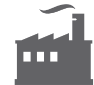
Industrial Fluid Handling