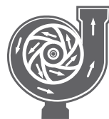
Up-Feed Pump Systems