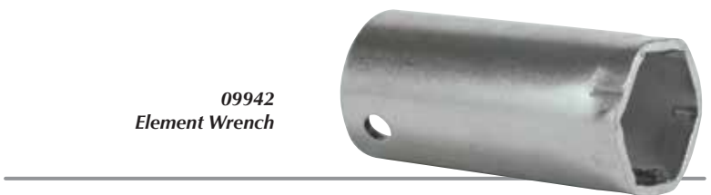
09942 Element Wrench