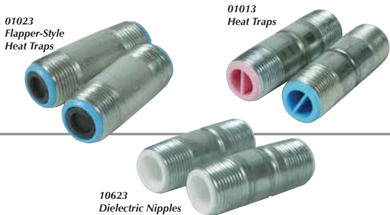
01023 Flapper-Style Heat Traps