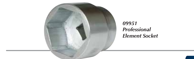
09951 Professional Element Socket