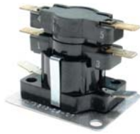
Sequencer (Flush Mount Plate w/Mounting Hole and Tab)