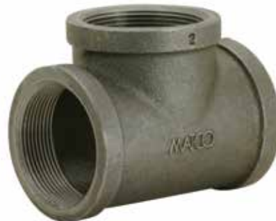
Sample Part # is: Chinese Malleable Black, 150LB, Tee, 2"