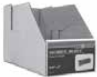
Bin Boxes with Labels