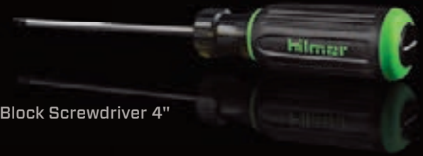
Terminal Block Screwdriver 4" 1891397